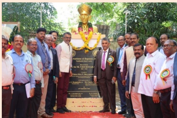
Floral offering to the portrait of Sir M Visvesvaraya statue by Chief Guests and Dignitaries

The 164 th Birth anniversary of Sir M Visvesvaraya was celebrated as 57 th Engineers' Day by the IE(I), Tamilnadu State Centre on Sunday the 15 th September 2024 at 11.00 am at IEI TNSC auditorium, Chennai. The ceremony commenced with the paying of rich tributes to Bharat Ratna Sir M Visvesvaraya, marked by the offering of flower petals by the Chief Guest, and other dignitaries.