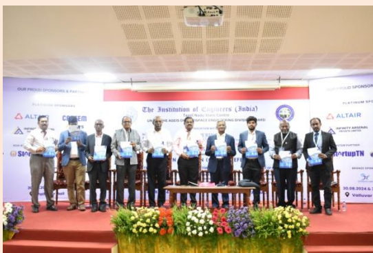
Releasing of Souvenir

Souvenir was released by the chief guest and the dignitaries were honoured with the shield.