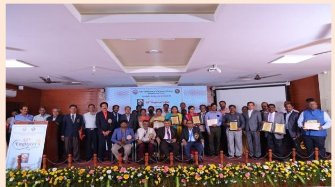
IEI TNSC Engineers Day Awardees with dignitaries

All awardees were honoured with shawl, memento and certificate. More than 100 participants were participated in the celebration.