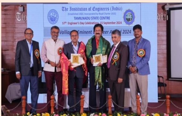
Awardees of Sri Valliappa Eminent Engineer Award 2024