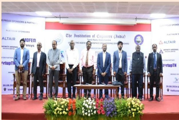
Dignitaries on dais

The Institution of Engineers (India), Tamilnadu State Centre organized All India Seminar on Trends in Aviation (Civil & Defence) under the aegis of Aerospace Engineering Division Board, IE(I) in association with IAAA and Periyar Maniammai Institute of Science & Technology, Thanjavur on 30 th & 31 st August 2024 at Periyar Maniammai Institute of Science & Technology, Thanjavur.